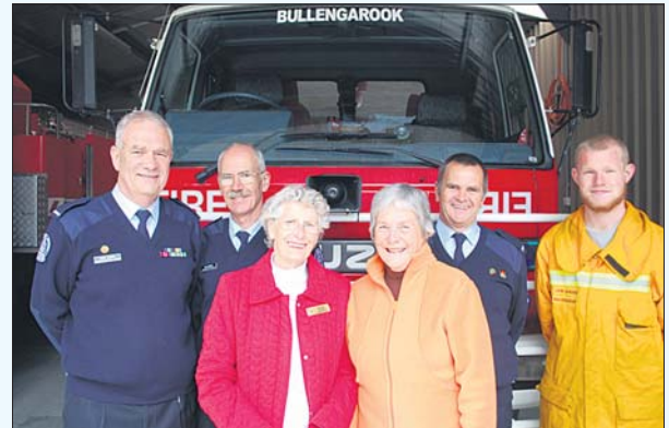
Funds raised from the CWA's Christmas Hamper will aid Bullengarook CFA.

Christmas Dinner at Macedon CWA Hall on 14 December. Our Catering Group will be busy with a sausage sizzle at Bunnings in Sunbury and catering for a social function. The group has also been making Christmas treats for the residents of the Elms and Oaks. Christmas greetings to all.