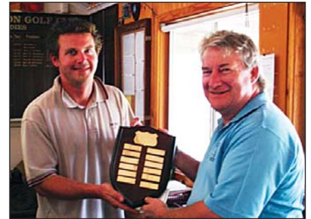
'Rock' Hudson accepts the G&S Trophy