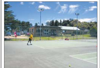
South Gisborne Tennis Club has had another successful year.